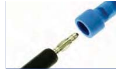
4.8mm Monopolar handles (foot controlled)