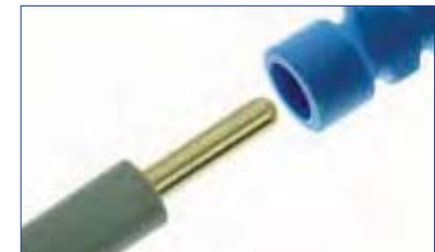
4.0mm Monopolar handle UK