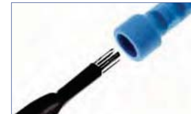
4.5 to 5.0mm Monopolar forceps